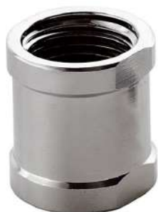
IMMAGINE - IMAGE