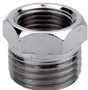
IMMAGINE - IMAGE