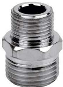
IMMAGINE - IMAGE