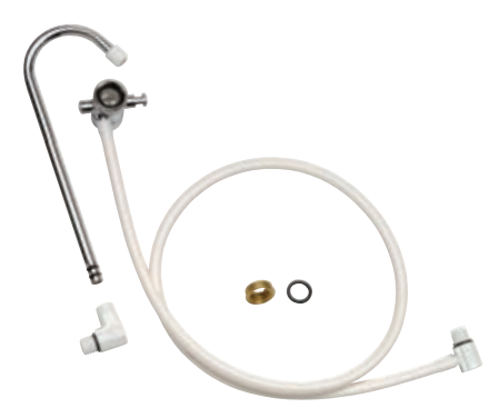
kit Depural® TOP ECO