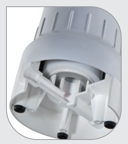
cartridges with standard flat seals.

DEPURAL® TOP housings are manufactured with the finest and most advanced materials under constant focus on innovative processing technologies and ceaseless modernization to ensure the absolute quality of our products.