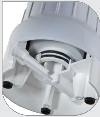
cartridges with 45 mm double o-ring collar. Quick-fit connection for a perfect tightening.