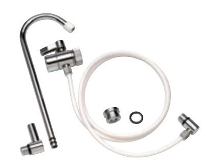
kit Depural® TOP DVB