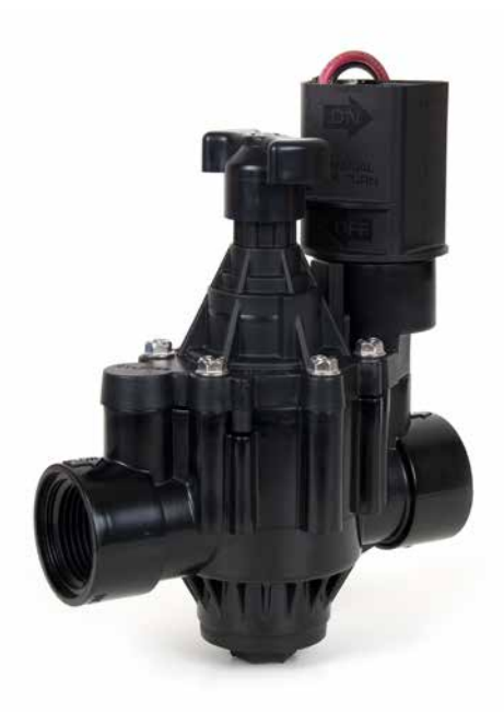
PGA Series Valve with TBOS Latching Solenoid

Whether the job calls for a globe or angle valve, PGA Series valves are the right choice. Loaded with features, these heavyduty PVC valves are economical, easy to install and built to withstand constant 150 psi (10.35 bar) pressure and 2 to 150 gpm (0.45 to 34.05m3/h; 7.8 to 568 l/m) flows.